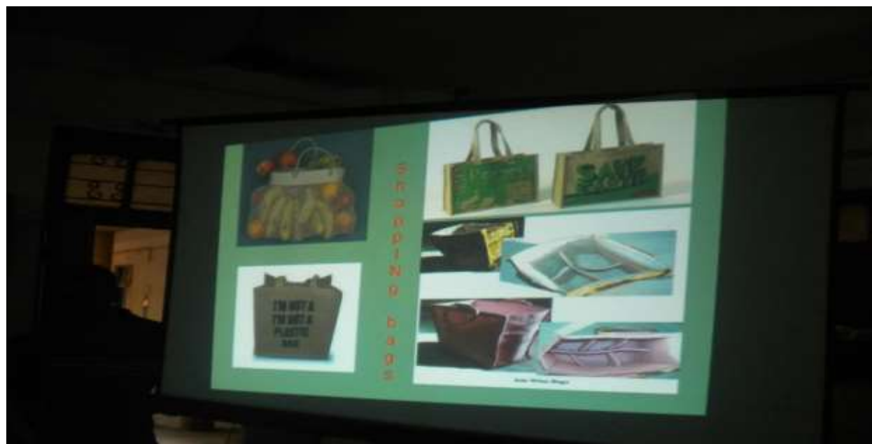
Powerpoint presentations in the programme