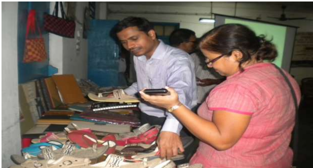
Secretary,NJB taking a glimpse of displayed Jute Diversified Products