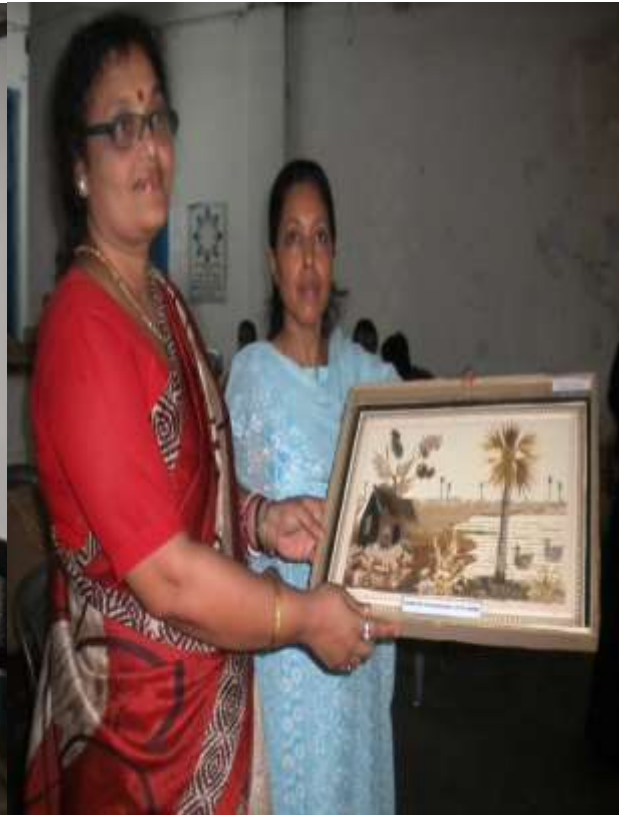
A Jute Memento being presented to the Principal