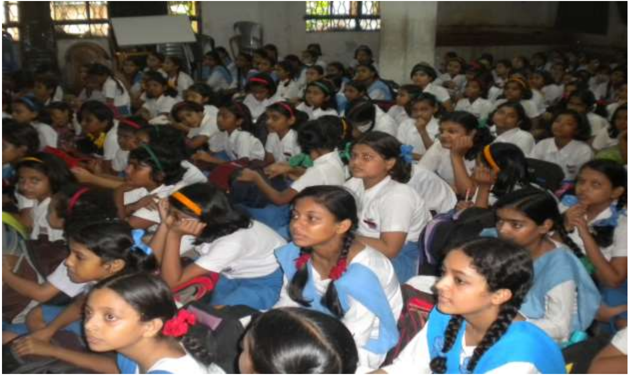
Students listening to welcome address by Secretary, NJB