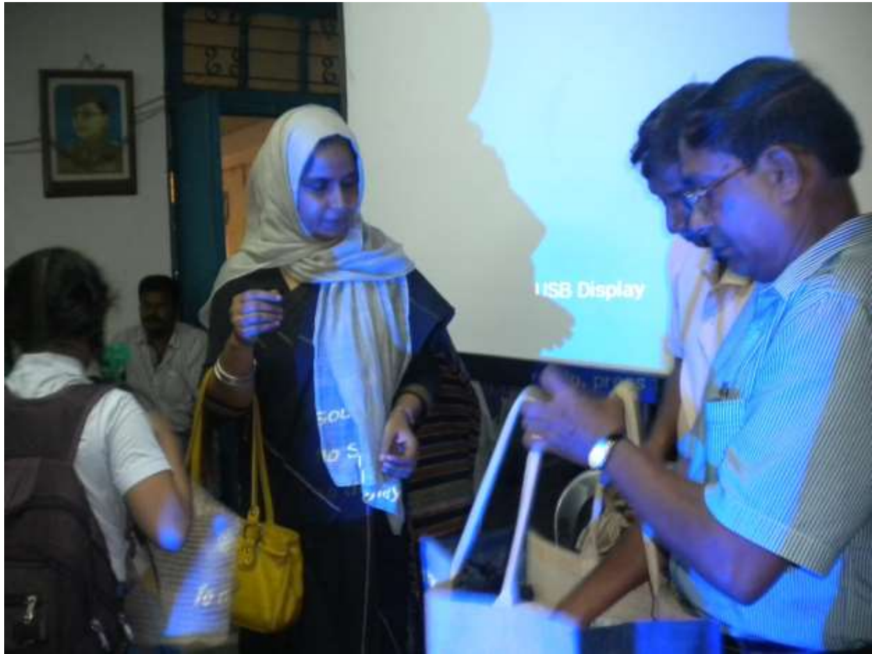
Glimpse of distribution of low cost jute bags amongst students

The Principal of the school promised that similar programmes may be held in the other sessions. The school authorities have requested for organization of training on JDPs for the students.